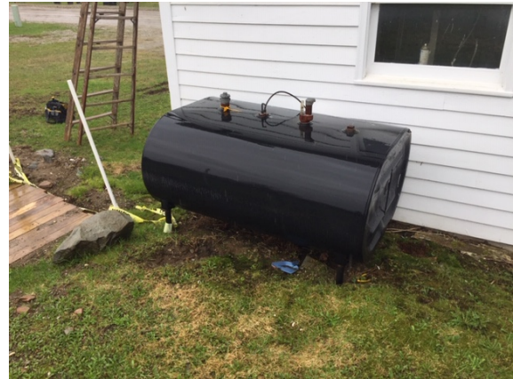
Photo #8: Exterior – 275-gallon Above Ground Storage Tank (assumed Kerosene)