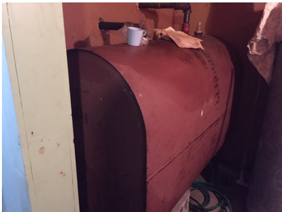
Photo #5: CPAI Area #07 – 275-gallon Above Ground Storage Tank (assumed #2 fuel oil)